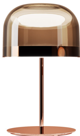
Table lamp with diffused and dimmable light generated by led inserted into two overlapping polycarbonate discs. The bottom disc produces a downward light output, the upper one illuminates the colored glass cover. Galvanized metal frame. Transparent glass diffuser. Black power cable, dimmer and plug. Plug-in power supply with interchangeable plugs (UK, USA, UE, AUSTRALIA). Integrated led.

Equatore is a contemporary reinterpretation of the classic lamp with a glass shade. While the traditional abat-jour uses the shade to contain the light source within, in this family of lamps the shade is paradoxically and suggestively empty, with the light being generated by two luminous discs placed inside a central metal band, visible on the shade, that evokes the line of the equator. The light produced by the Leds, thanks to internal screens arranged in layers, is distributed regularly across the surface of the discs, magically illuminating them. The bottom disc directs the light output downward, the upper one illuminates the glass cap for a soft, diffused light. Available in table, floor and ceiling models, in two sizes and two colors: a cooler version in gray with a dark chrome frame, and a warmer version with a transparent dove gray cap and a copper-colored frame.