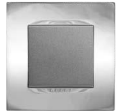
Bright chrome (BC)