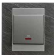
Double pole switch