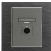
Fused connection unit