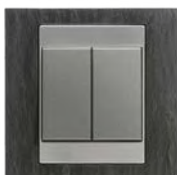
2 gang 2 way switch