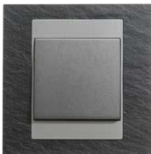
Natural slate (NS)

The Unica Class brings the roughness of minerals, the beauty of crystal transparency, and many other sensations into your property and life. It's like experiencing the comforting sight of ocean waves, dust from ochre colored soil, or the chilly hardness of jagged rock.