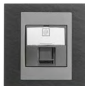
RJ45 data socket