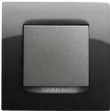
Rhodium black (RB)

Create a unique atmosphere that speaks to your personality and design aesthetic with Unica Top. It's a reflection of your personal style that makes a solid statement and draws attention. Unica Top is made to last, and to make a lasting impression.