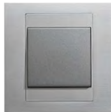
Ice aluminium (IA)