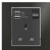
13A 1 gang switched socket with 2 gang USB charger socket