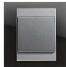
Black mirror (BM)