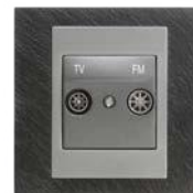
TV/FM individual socket