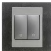
Roller blind switch