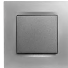
Matt chrome (MC)