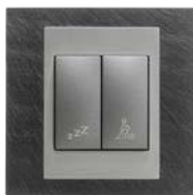
Control unit for outdoor panel