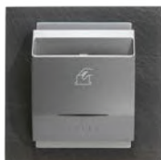
Key card switch