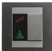
Indicator panel and bell switch