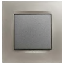
Matt nickel (MN)